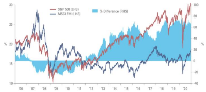
Fig 2: Long-term price earnings ratio

Source: Ashmore, Bloomberg. Daily data as at 20 November 2020.